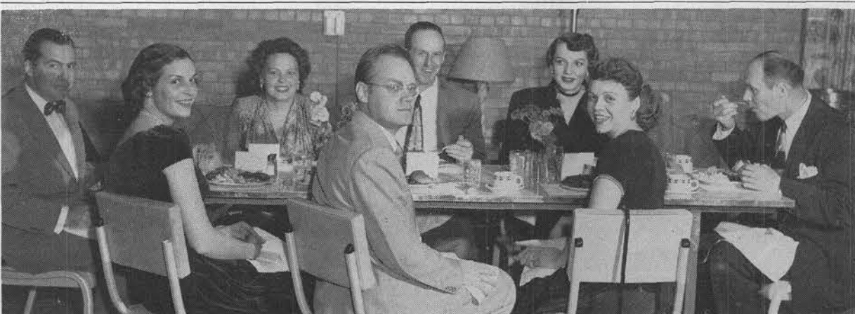
ENJOYING a departmental dinner party are these Sandians who were among those present when 1710 and wives and friends gathered at the Coronado Club.

Cost of the evening's entertainment will be-members, $1.50 per person, and guests, $2 per person.